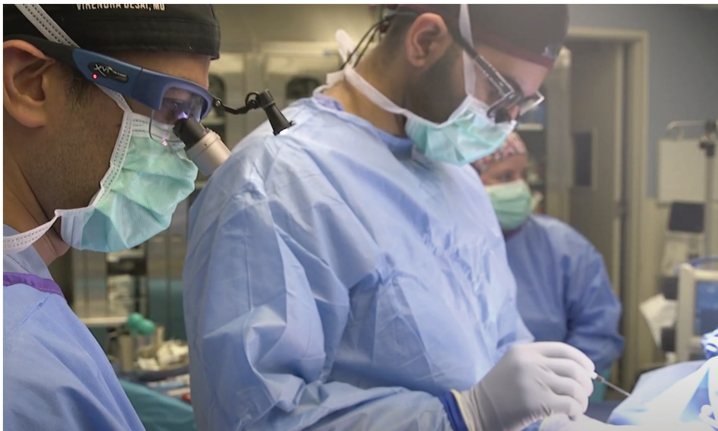
Pediatric Neurosurgery Team at Oklahoma Children's Hospital Performs First Pediatric Robotic DBS Procedure.

As a result, her care team at both Oklahoma Children's Hospital and Bethany Children's explored other treatment options. Together, they decided she was a good candidate for a new procedure that would advance her care. "This marked the global debut of using a robot from our operating rooms to perform DBS in a child, setting a precedent not only in Oklahoma but also across the United States and worldwide," said Oklahoma Children's Hospital pediatric