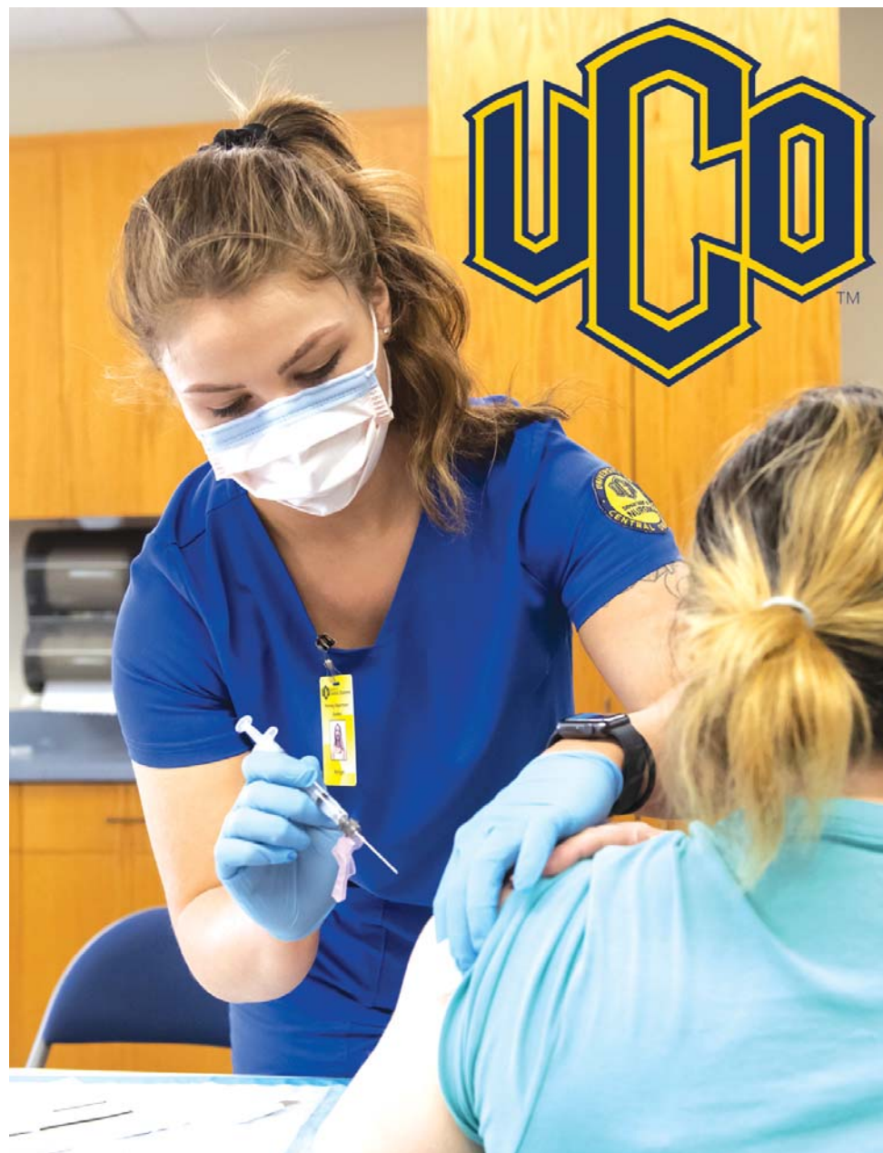
A UCO nursing degree opens up a myriad of possibilities.