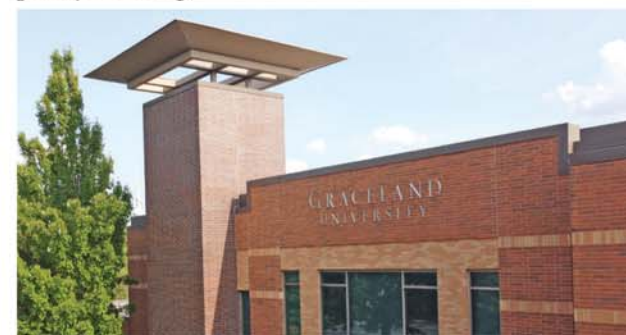
Graceland's commuter campus in Independence, MO

In response to societal needs and a strong commitment to nursing education excellence, Graceland offer the Doctor of Nursing Practice (DNP) in Organizational Leadership degree . This highly sought after online terminal degree will prepare you for a wide range of high-level responsibilities in patient care, health care systems, academics and policy making.