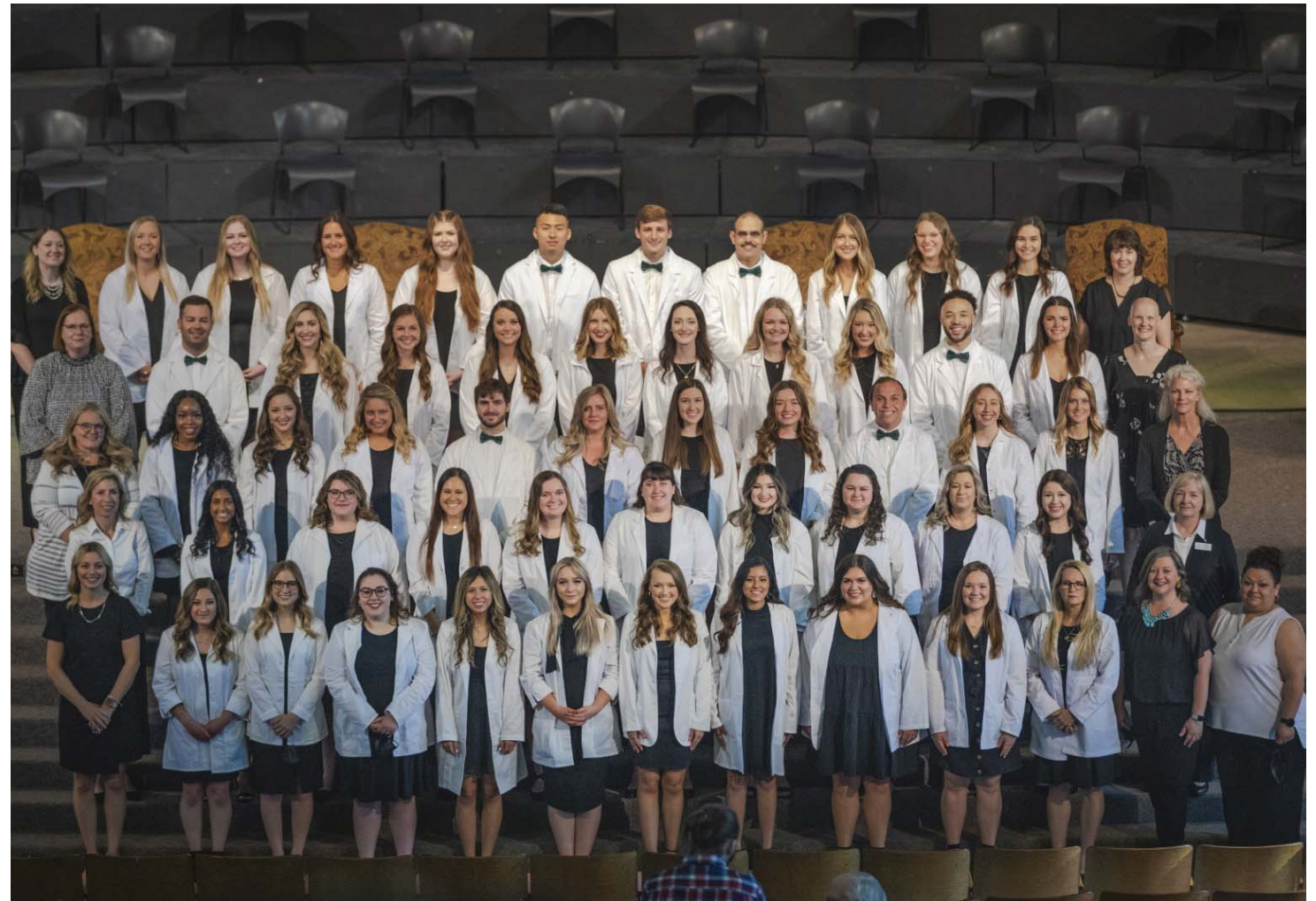
Nursing graduates honored during Pinning Ceremony May 14 at Oklahoma Baptist University in Shawnee.

With its campus located in Shawnee, OBU offers 10 bachelor's degrees with more than 80 fields