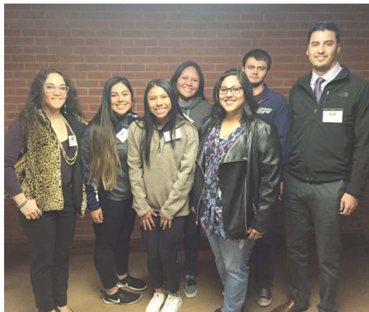
Students stop for a picture at the ONASHE Conference.

Seven students from St. Gregory's University attended the Oklahoma Native American Students in Higher Education (ONASHE) Conference on February 25, 2017. The conference offered three days of workshops and a variety of activities.