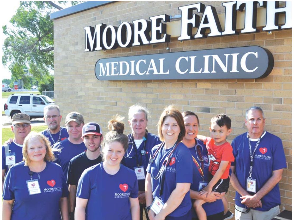
Nurses, physicians, pharmacists, pastors and case workers donate their time to help those in Cleveland County with nowhere else to go.