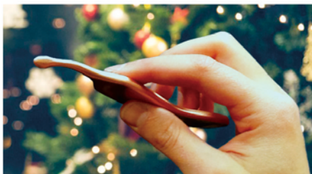
New research: Copper stops colds if used early.

prevention. Karen Gauci, who flies often, used to get colds after crowded flights. Though skeptical, she tried it several times a day on travel days. "Sixteen flights and not a sniffle!"