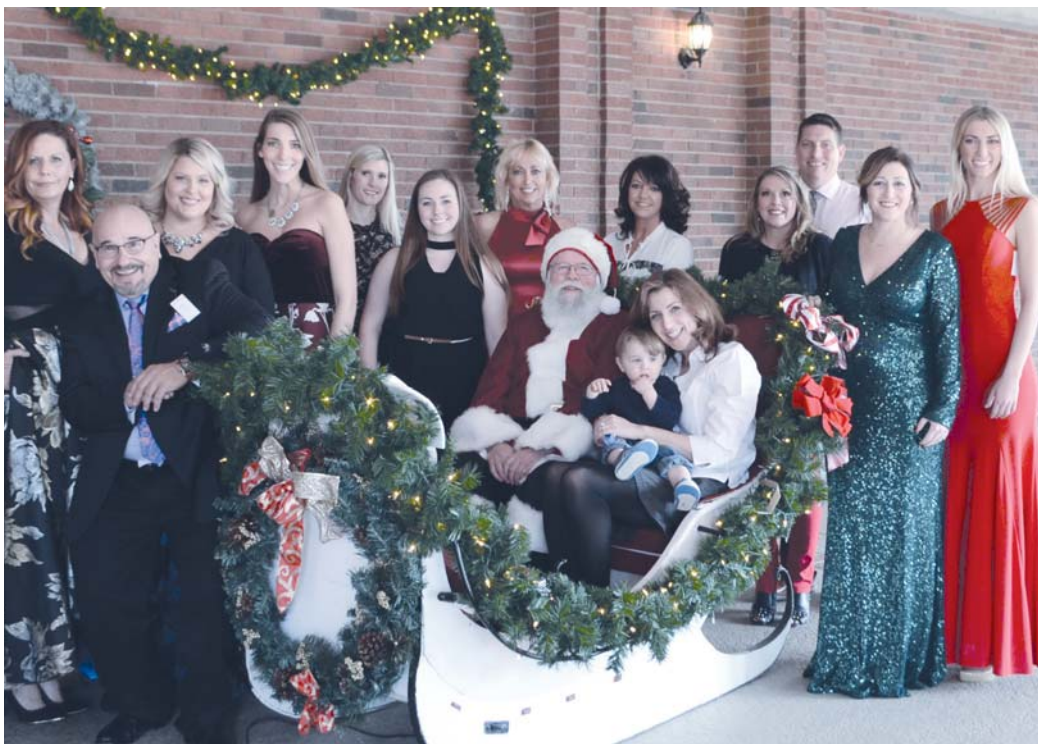
Models from the CMSA Christmas Charity Fashion Show along with Santa at The Tulsa Country Club on Dec. 14.

CMSA of Eastern Oklahoma is a local chapter of the Case Management Society of America, an international, 501(C)(6) nonprofit association for case management professionals. Our membership is comprised of case managers, care managers, nurses, social workers, rehab specialists, physicians, students, and corporations as well as suppliers that support the case management industry.