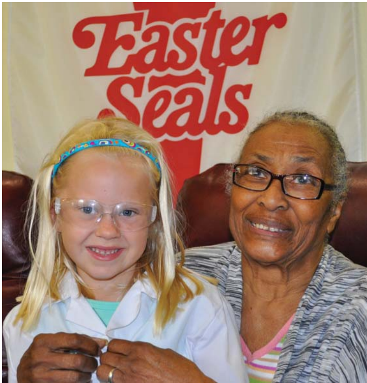
Seniors are enjoying spending their days around children at Easter Seals' unique Adult Day Center in Oklahoma City.