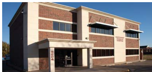
Northwest Surgical Hospital.

HPI Holdings LLC, an operator of hospitals, outpatient centers and clinics in Oklahoma City, INTEGRIS, Oklahoma's most advanced health care system, and United Surgical Partners International (USPI), a leading provider of ambulatory services in the United States, have entered into an agreement to form a joint venture designed to offer patients and families more choice and flexibility of care settings.